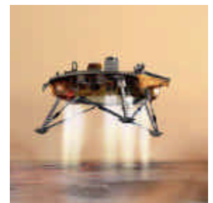
Artist's rendition of the Phoenix lander

Canada: 300 Interchange Way • Vaughan, ON Canada L4K 5Z8 Tel: [905] 660-0808 • Fax: [905] 660-0829